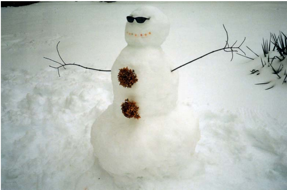
Always optimistic, a Grimesdale resident enjoys the snow while looking forward to sunny weather.